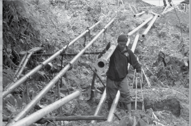
Steel Pipes for Tres Hermanos Ram Pump System, near Bacolod, Negros Occidental, Philippines, June 2010.

Green Empowerment was a 2010 Light A Fire Award Winner for accomplishing the Most with the Least , Portland Monthly Magazine .